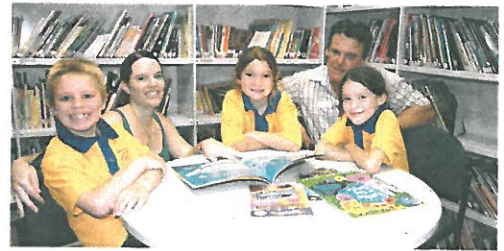
• School of the air children making learning fun.