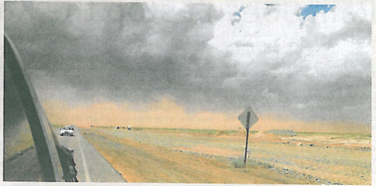
• Looking back after driving through the dust storm